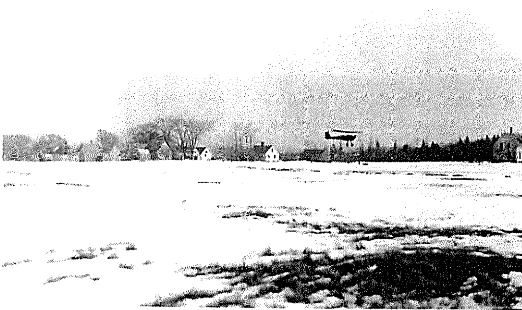
Winter landing, 1930s. Courtesy of Raymond Strout