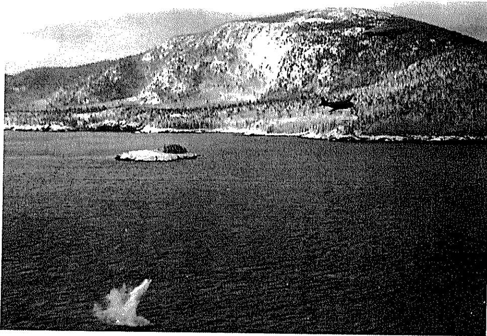
Plane dropping torpedo bomb in Frenchman Bay off the Thrumcap, 1944.

place here during the war. It appears from these photos that torpedoing the Porcupines was also part of the training.