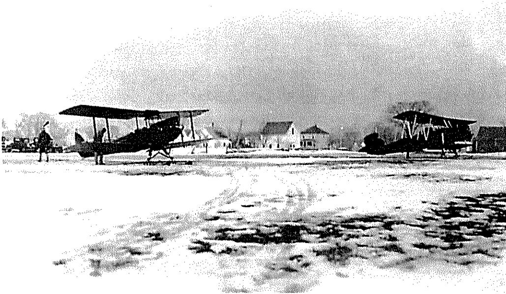
Tail-draggers tied down next to runway with houses on Route 3 in the background.